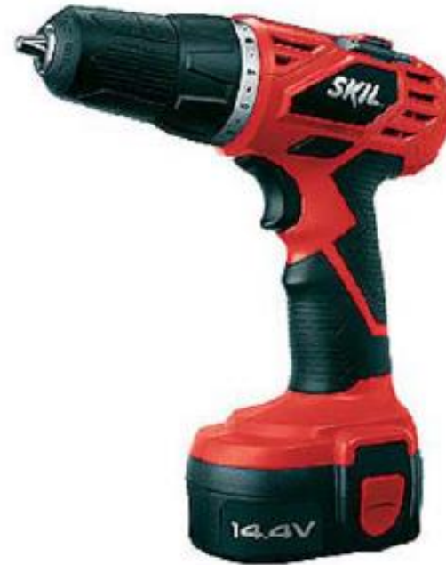
Skil 2250-01 14.4V Cordless 3/8-in Drill Driver Kit