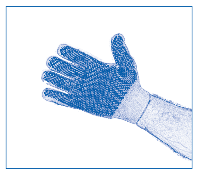
Figure 1. PVC-dot grip style gloves for use with drywall.